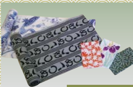
TOKYO HONZOME YUKATA INDIGO DYED SUMMER KIMONO