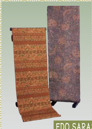
EDO SARASA PRINTED SILK CALICO