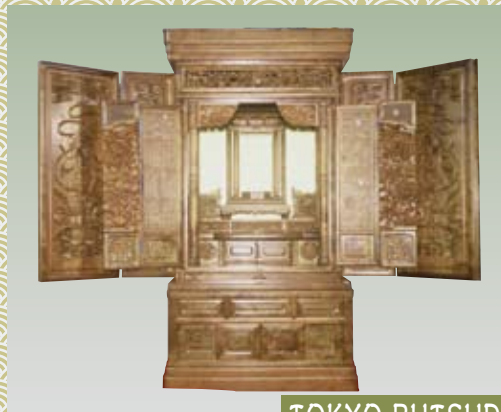
TOKYO BUTSUDAN BUDDHIST ALTARS