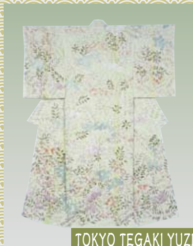
TOKYO TEGAKI YUZEN HAND-PAINTED KIMONO