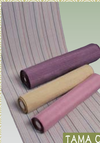
TAMA ORI TAMA WEAVE