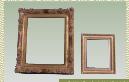
TOKYO GAKUBUCHI PICTURE FRAMES