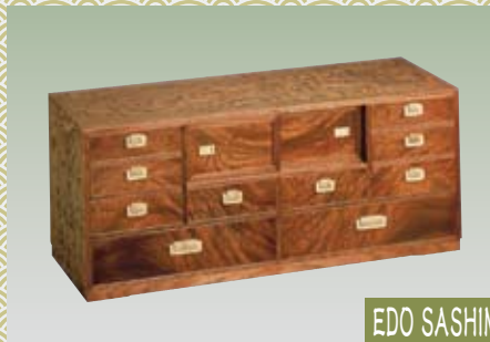
EDO SASHIMONO WOOD JOINERY