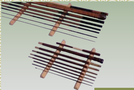
EDO WAZAO JAPANESE FISHING RODS