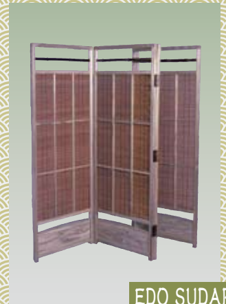
EDO SUDARE REED BLINDS