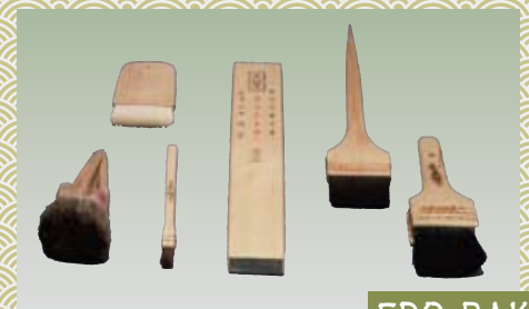
EDO-BAKE PAINT BRUSHES

Over many years, traditional handicrafts of Tokyo have been nurtured by the local natural environment and history. They are the products of traditional techniques and methods that have lasted through generations. At present, 41 separate items have earned designation as traditional handicrafts of Tokyo.